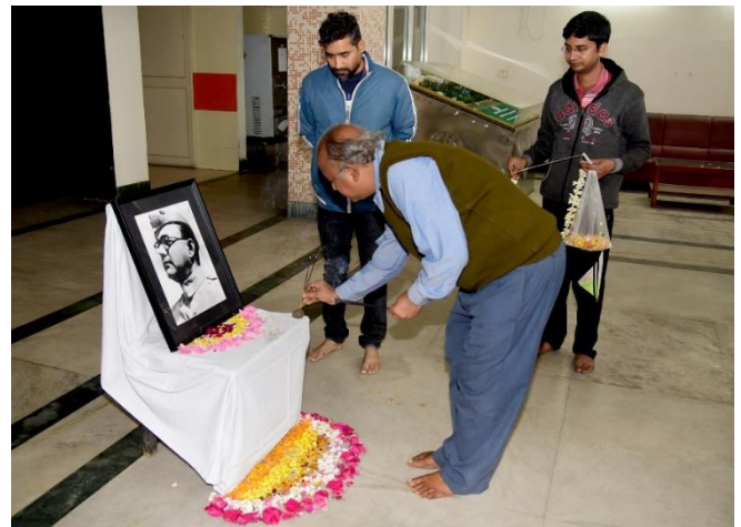
d) Observation of the 125 th Birth Anniversary of Netaji Subhash Chandra Bose on January 23, 2022